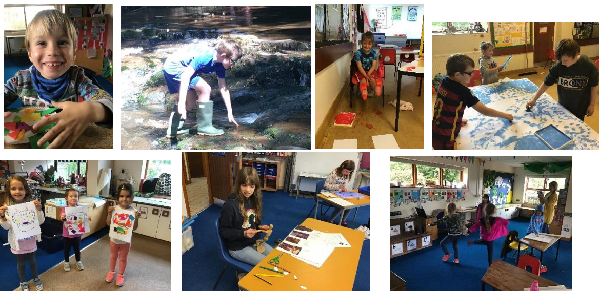
A selection of our 'Check in and Catch up' sessions.

The school said goodbye to our Year 6 leavers, not in the way we had hoped and planned, but in a fun way which was fitting as the group of leavers were a group of fun loving characters. They chose to have a barbecue in the school grounds, and had great fun and got very wet at a local river adventure.